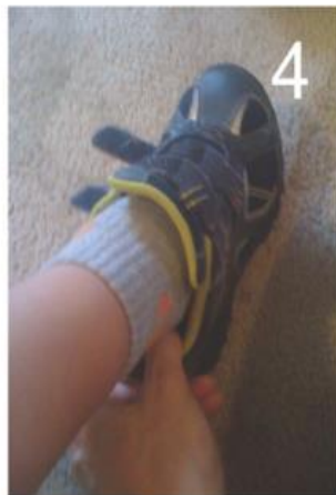
Pull out the back