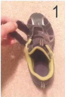
Open the straps