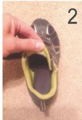
Lift the tongue