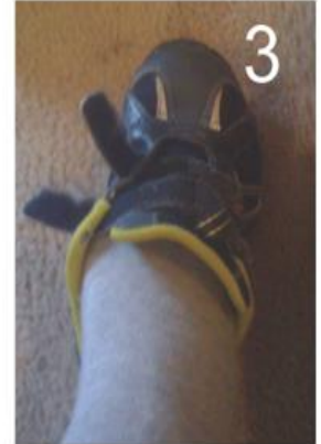
Put your toes in